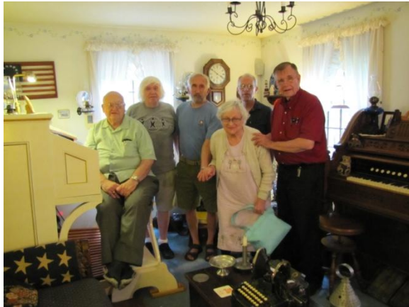
PTC-ATOS at "Haskell Hall"